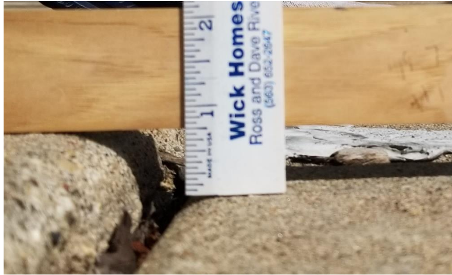
\frac{3}{4} " Violation