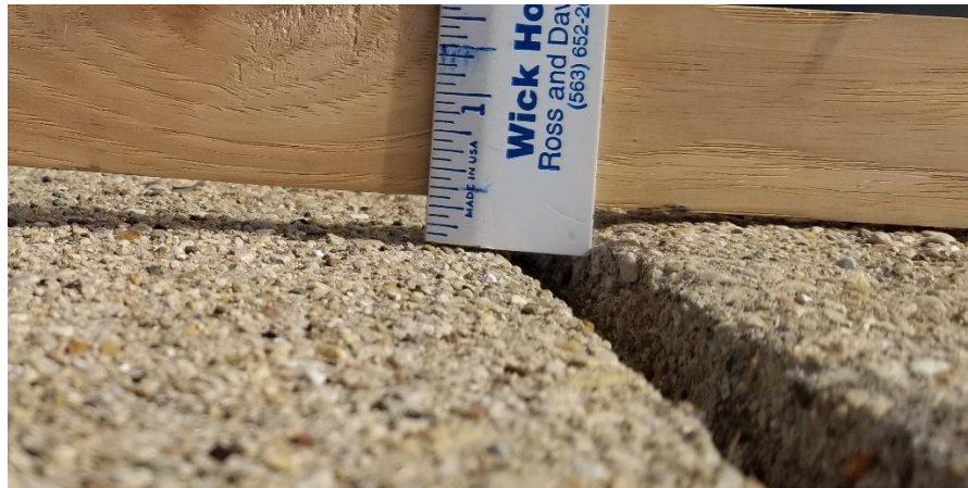
\frac{5}{16} " Violation